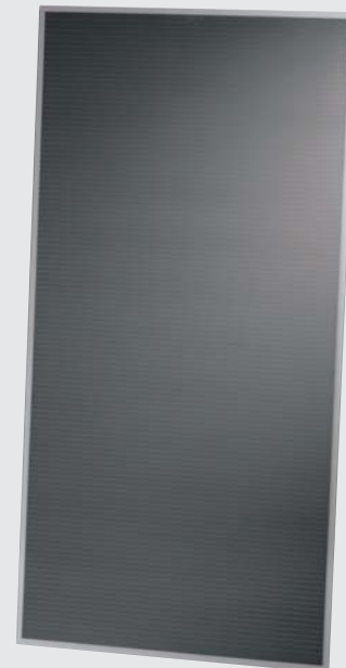
FS Series 2 Solar Module