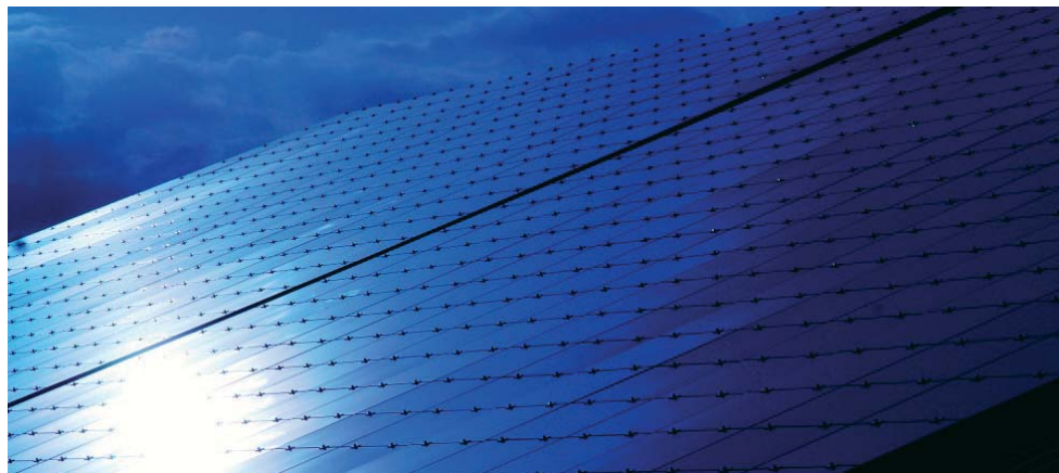
Commercial Solar Power Plant

First Solar's FS Series 2 PV Modules represent the latest advancements in thin-film solar module technology. The Series 2 modules are IEC 61646 and Safety Class II (SK II) certified for use in systems up to 1000 VDC. First Solar provides cost effective thin-film module solutions to leading solar project developers and system integrators for large scale, grid connected solar power plants. First Solar application engineers provide technical support and comprehensive product documentation to support the design, installation, and long term operations of high performance PV systems.