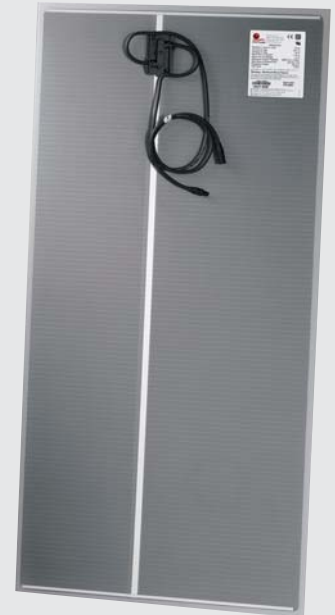
FS Series 2 Solar Module